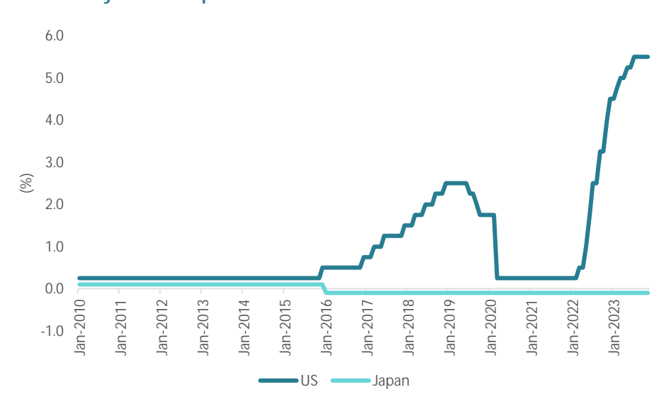
Chart 3: Policy rates of Japan and the US

In 2023, the BOJ made significant strides in phasing out its yield curve control (YCC) policy. As we look ahead to 2024, the next anticipated step in this gradual process of policy normalisation is the exiting of the negative interest rate policy, with the BOJ policy rate currently standing at minus 0.10% <sup>6</sup>(Chart 3). This is expected to be a focal point of the BOJ's actions early in 2024.