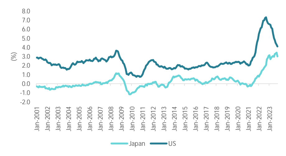
Chart 1: Trimmed-mean Consumer Price Index (CPI) year-over-year percentage change