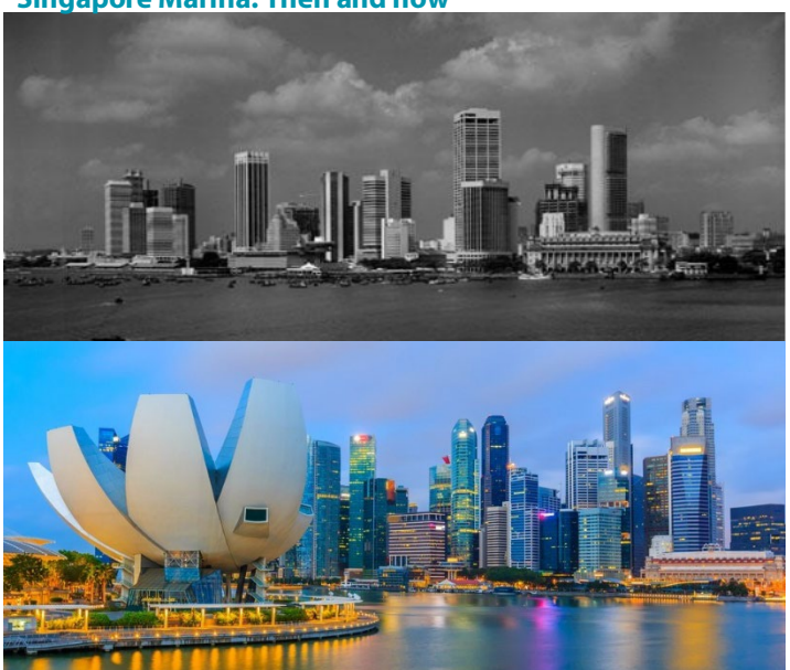
Singapore Marina: Then and now

We have found little academic or investment research looking specifically at fundamental change, particularly within Asia and emerging markets. This excites us because it suggests that such opportunities are less well understood.