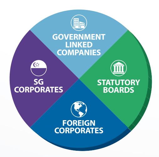
For pictorial illustration only.

The Index comprises bonds issued by established and credible institutions such as sovereign wealth fund Temasek Financial I Limited and statutory boards such as the Housing Development Board (HDB) , the Land Transport Authority (LTA) , and the Public Utilities Board (PUB) .