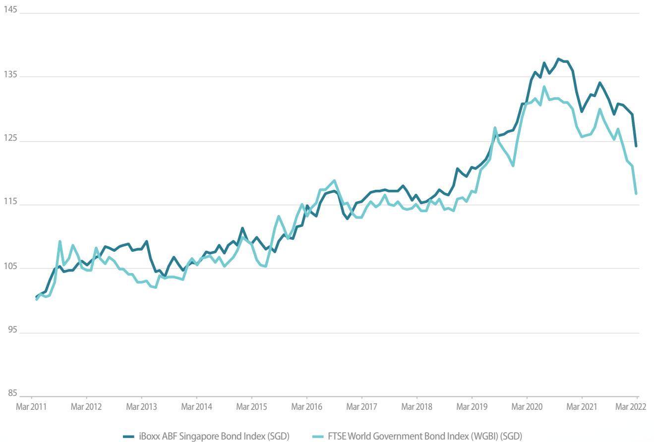
Figure 2: Comparison of Index Performance between the iBoxx ABF Singapore Bond Index and FTSE World Government Bond Index (rebased to 100 as of March 2011)

This chart is purely for illustrative purposes only and not to be relied upon as financial advice in any way. Index performance does not factor in any management fees, transaction costs or fund expenses. Data of the Index presented here may not be exactly the same as that of the Fund. Returns and performance figures are stated in SGD terms. Past performance is not indicative of future performance.