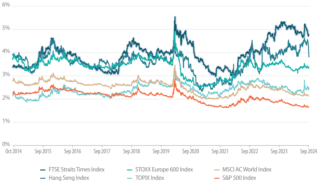
Figure 2: 10-Year historical dividend yields (1 Oct 2014 – 30 Sep 2024)

Dividend yields of the Straits Times Index have been relatively attractive across a 10-year period, ranging consistently around the 3.0% to 5.0% levels.