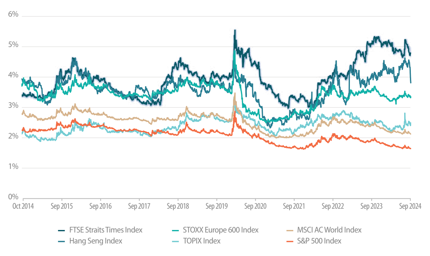
Figure 2: 10-Year historical dividend yields (1 Oct 2014 – 30 Sep 2024)

Dividend yields of the Straits Times Index have been relatively attractive across a 10-year period, ranging consistently around the 3.0% to 5.0% levels.